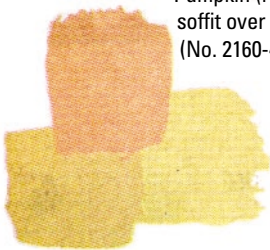
Benjamin Moore earth tones.

like a honeymoon suite in the Poconos," says Wiener. If you plan to stay awhile , simple crown molding would add architectural interest, and a recessed ceiling light above each nightstand would showcase the headboard and curtains. (Maybe that nice landlord would kick in on this permanent improvement). Center the mirror over the low dresser and flank it with the existing bedside lamps.